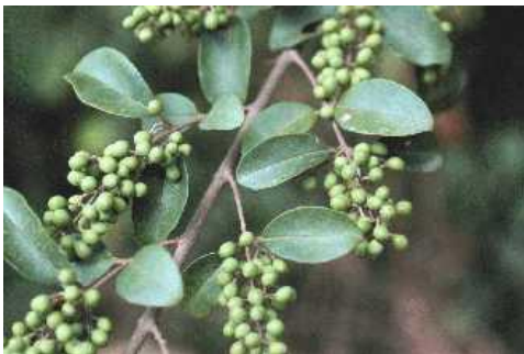
Leaves with developing fruit.

Chinese privet grows in a wide variety of habitats and can tolerate a wide range of soil and light conditions, but it grows best in mesic soils and abundant sunlight but can tolerate lower light conditions (Thomas 1980; Bailey & Bailey 1976). Few woody plants offer an easier test of gardeners' skills.