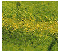
Midvein of lower leaf surface showing hairs.

Chinese privet is similar to Common Privet ( Ligustrum vulgare ), a European species that is naturalized in more temperate areas of the eastern United States. Chinese privet has evergreen to semi-evergreen leaves, densely hairy twigs and petioles, pubescent midveins on its lower leaf surfaces, and exserted stamens. In contrast, common privet is deciduous to somewhat evergreen with sparsely pubescent twigs, glabrous midveins, and included stamens (the tips of the anthers are shorter than the extended corolla lobes) (Gleason 1952).