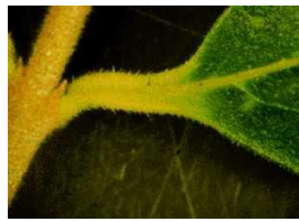
Petiole, leaf base & margin.

Chinese privet is similar to Common Privet ( Ligustrum vulgare ), a European species that is naturalized in more temperate areas of the eastern United States. Chinese privet has evergreen to semi-evergreen leaves, densely hairy twigs and petioles, pubescent midveins on its lower leaf surfaces, and exserted stamens. In contrast, common privet is deciduous to somewhat evergreen with sparsely pubescent twigs, glabrous midveins, and included stamens (the tips of the anthers are shorter than the extended corolla lobes) (Gleason 1952).