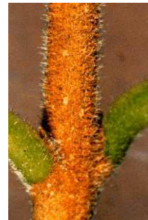
© L. Urbatsch Petiole, axillary bud, stem with spreading

General: Olive Family (Oleaceae). Chinese privet is a shrub or small tree that may grow to as much as 30 feet tall although its typical height ranges from 5 to 12 feet. If flowering, its blossoms are very aromatic. Its root system is shallow but extensive. Suckers are readily produced and the plants can spread vegetatively in this fashion. The plants branch abundantly and the branches typically arch gently downward. Its twigs are usually densely hairy (pubescent) when young, and the plant hairs (trichomes) spread at right angles from the twig surface. Raised, tan-colored lenticels are also evident on the twig's surface. Chinese privet leaves are evergreen to semi-deciduous and are oppositely arranged (two leaves per node) along the stem on nodes that are usually less than one inch apart. The leaf stalk (or petiole, shown below) is about one-