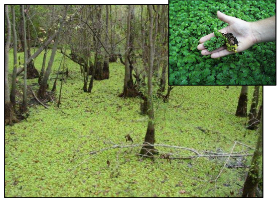
Image: Giant Salvinia in the River Bend Swamp, Pender County, N.C. September, 2002.

Description: A free floating aquatic fern with a horizontal rhizomes (lies below the water surface) and two types of fronds in whorls of three (2 floating and 1 submerged). Floating fronds are positioned opposite to each other on the plant stem, up to 1.5” long, oblong in shape, with a distinctive fold in the center, and vary in color from light green to golden brown. Upper surface of the floating frond has rows of ‘egg-beater’ tipped hairs that trap air and enable the plant to float. Submerged fronds function in water and nutrient uptake. The mature plant produces egg-shaped spore sacs containing infertile spores. Reproduction is by stem fragmentation and budding.